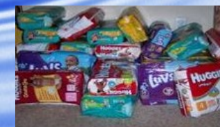
disposable diapers nursing pads