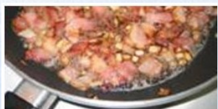
fats, oils, grease