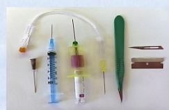
syringes, needles, razors