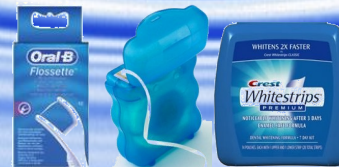
dental floss/teeth whitening strips