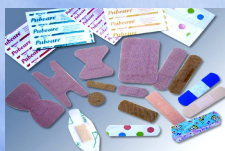
bandages & wrappers