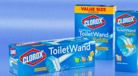
disposable toilet brushes