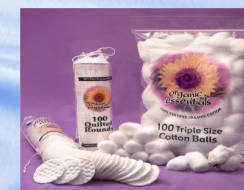
cotton balls, swabs, pads