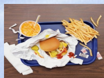
food & food wrappers