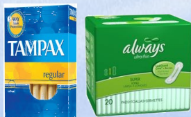
tampons/applicators sanitary pads