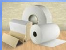
paper towels, tissues